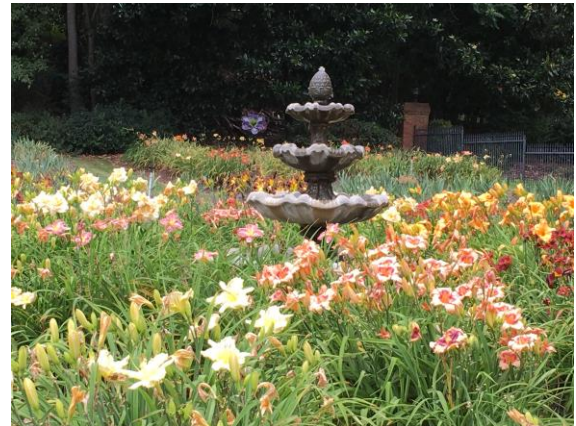
Class 4 - Landscape image