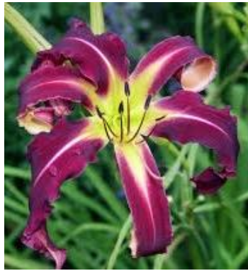
Class 1 - Single Bloom image