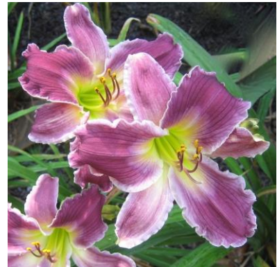
Class 2 - Multiple Bloom image