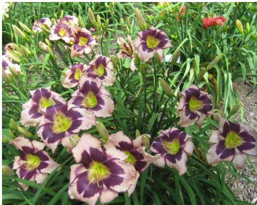
Class 3 - Clump image